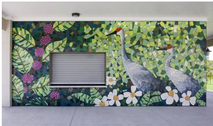
Best Site-Specific or Architectural Project Cherie Bosela, "Natural Florida"